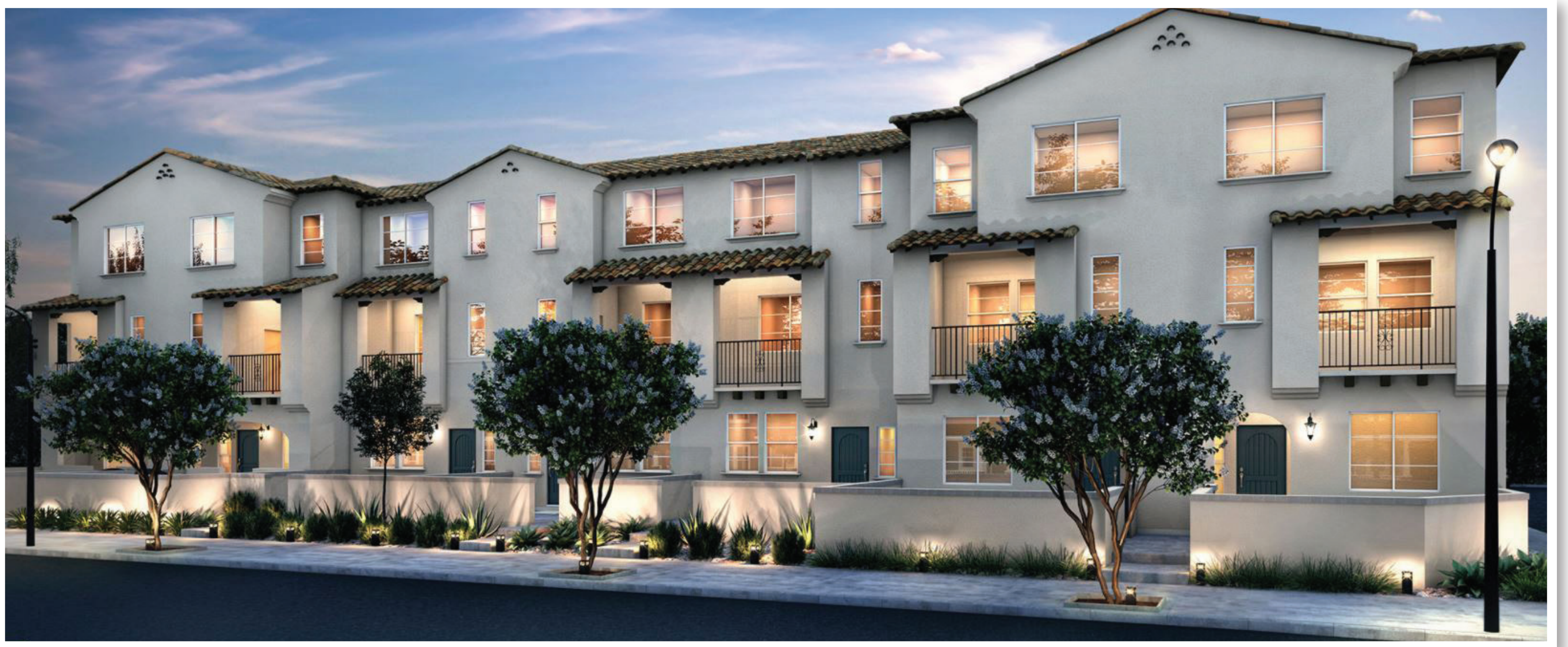
Laurel Walk - 13811 Valley View Avenue

A small to medium (1-3 story) sized attached structure that consists of multiple dwelling units and often faces a street or courtyard. The street faces have front door entrances and the garages are either in the back of the structure or absent.