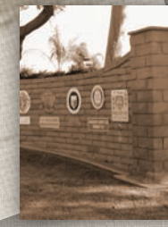
Stage Coach Stop Imperial Highway & Cordova Road

The southeast corner of this location was once the site of a stage coach stop. A historic marker is found at this location.