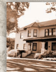
Neff Estate 14300 San Cristobal Drive

The Neff Estate covers 10 acres and includes three historic buildings. The Neff site was placed on the National Register of Historic places in 1978 in recognition of its role as a historical, educational and social center.