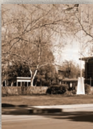
Biola University 13800 Biola Avenue

This roadway was once a dirt path. Biola University was built at this location in 1959. This was the location of the first City Council meeting and the former site of McNally Junior High School.