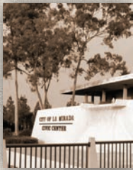
La Mirada City Hall 13700 La Mirada Boulevard

La Mirada City Hall provides a variety of public services for the community and is the location of City Council meetings. The first City Hall was located on the southeast corner of Rosecrans Avenue and Valley View Avenue.