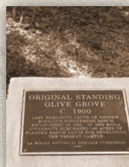
Olive Grove at Biola University

Located on the west side of La Mirada Boulevard across from the Civic Center, this site is home to the last contiguous section of olive trees in La Mirada. La Mirada once had a flourishing agricultural industry which raised olives and citrus fruit.