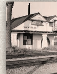
Train Depot Stage Road

The Train Depot built by Andrew McNally in the early 1890's was an iconic location. It was demolished in 1962.