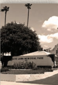
Olive Lawn Memorial Park 13926 La Mirada Boulevard

Olive Lawn Memorial Park is one of the few remaining family operated cemeteries in Southern California. It was the first business in La Mirada.