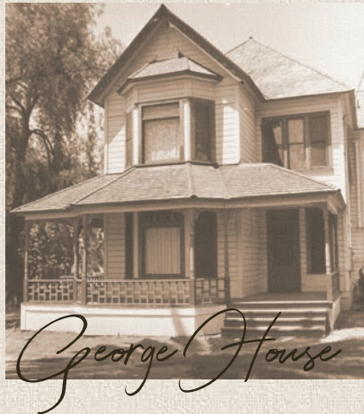
The George House, located at the Neff Estate, is the oldest home in La Mirada.

You can learn more about La Mirada's history by browsing the internet, reading books and going for a walking or biking tour.