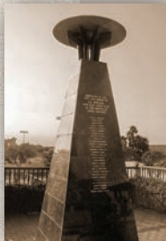
Eternal Flame 13700 La Mirada Boulevard

To the south of City Hall, an Eternal Flame burns above the names of La Mirada servicemembers who gave their lives for their country since 1960, the year the City was incorporated.