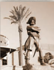
La Mirada Civic Center 13700 La Mirada Boulevard

The La Mirada Civic Center features several facilities serving the community such as City Hall, Splash!, Activity Center, Resource Center, Community Gymnasium, Los Angeles County Library and Community Sheriff's Station.