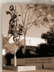
La Mirada Theatre for the Performing Arts 14900 La Mirada Boulevard

The award-winning La Mirada Theatre for the Performing Arts has served the region's cultural needs since 1977.