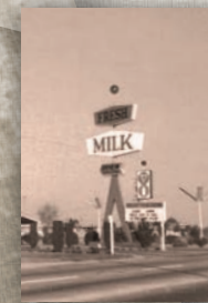
Valley View Farms 14101 Rosecrans Avenue