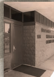
Windermere Park 15261 Cheshire Street

This park was once the location of the George Bell Reeve Estate.