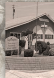
La Mirada First Fire Station 14340 Valley View Avenue

La Mirada's first Fire Station was located on Valley View Avenue. Current Fire Stations are located in the La Mirada Civic Center and on Beach Boulevard.