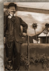
La Mirada Post Office 14901 Adelfa Drive

The lobby of the Post Office houses a display of historical photographs, figures and text depicting La Mirada's early years. It was dedicated in 1970.