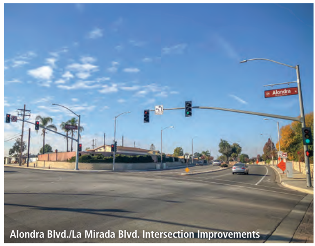
Alondra Blvd./La Mirada Blvd. Intersection Improvements