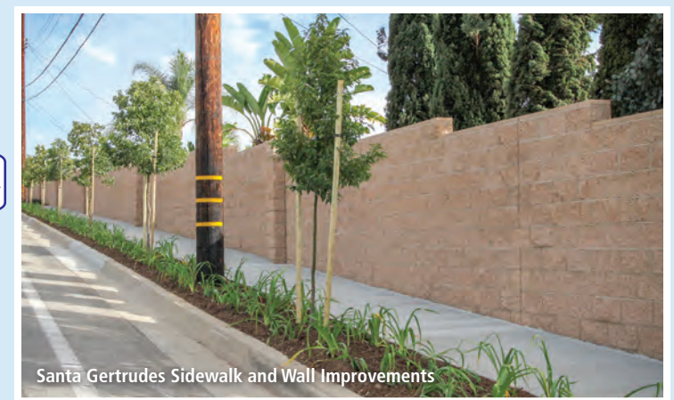
Santa Gertrudes Sidewalk and Wall Improvements