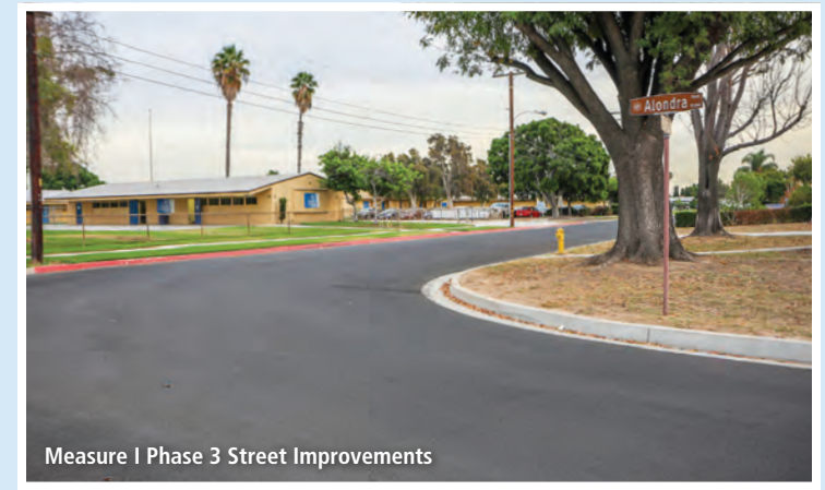
Measure I Phase 3 Street Improvements